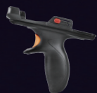
Scanning Pistol Grip