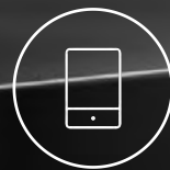
6.5 in Display