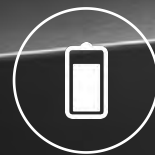
5000mAh Smart Battery