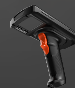
Scanning Pistol Grip