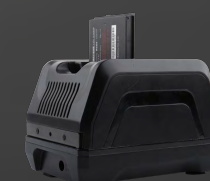
4 Batteries Charge Cradle